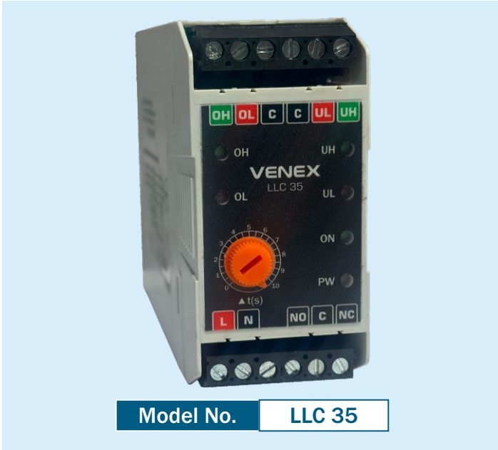
Model No. LLC 35

This section gives you all the information necessary to help you monitor and operate your controller including an Operator Interface overview, an explanation of the Displays, keys, LEDs, Mode access, and Operation Modes.